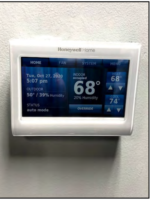
New web-enabled thermostat